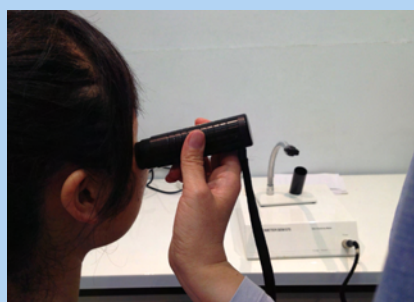
1. CUTOMETER IN USE