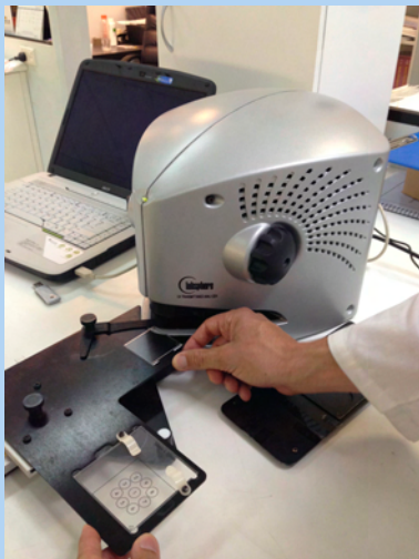
2. SPECTROPHOTOMETRIC MEASUREMENT